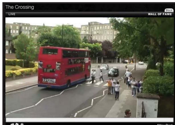
The view from the new Abbey Road webcam without the sound

You can find the webcam at http://www.abbeyroad.com/visit/ .