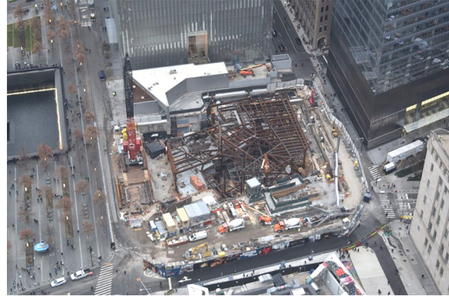
The site of the WTC performing arts center in December 2018.

The Ronald O. Perelman Performing Arts Center is scheduled to be completed in 2021.